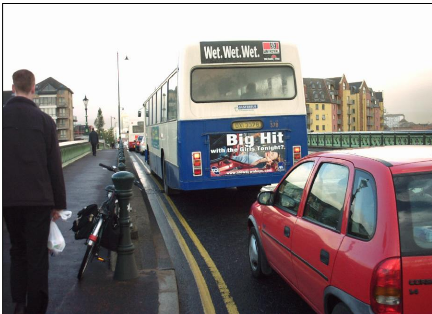
New bridge would provide safe alternative to the Albert Bridge